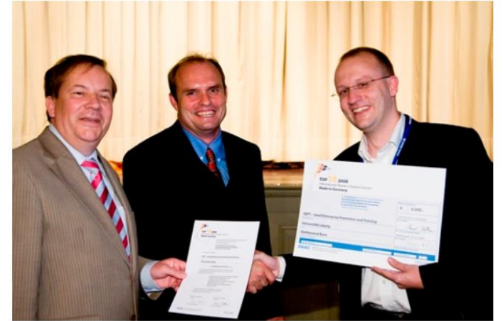
"Quality Label for the Top 10 International Master Study Programmes in German Universities"